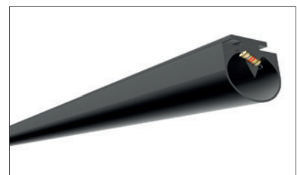
Conductive rubber normally open safety edge 8.2 k \Omega

The Carlo Gavazzi wireless system is compatible with alternative safety edges, for instance: